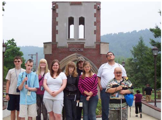
2009 INSIGHT participants take time out of their busy schedule for a group photo.

INSIGHT is for students who have just completed their junior year of high school however sophomores and seniors may apply. While at MSU, the participants live in dorm rooms with roommates, attend a class for a week (yes, homework is included), receive student I.D. cards, attend orientation classes, are involved in sports/recreational activities, learn study skills, talk with current college students with visual impairments, do their own laundry,